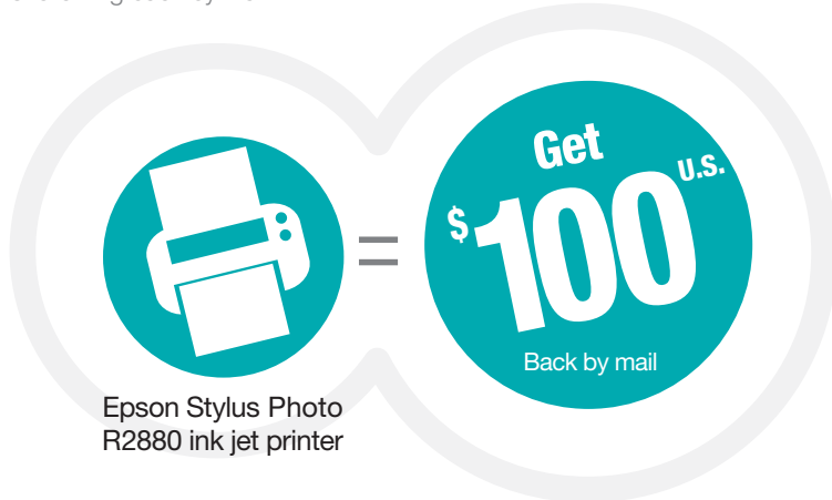
Epson Stylus Photo R2880 ink jet printer

PRODUCT MUST BE PURCHASED BETWEEN 12/6/09 AND 1/31/10.